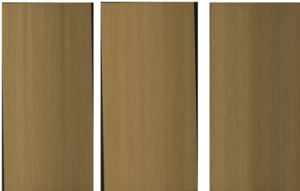
Backside Natura Select